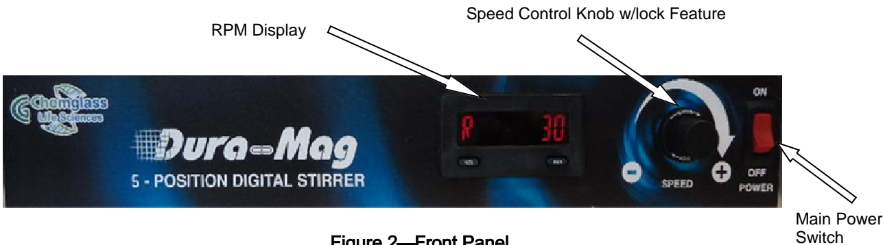
Figure 2—Front Panel

To operate, turn the main power switch to the "ON" position. Turn the speed control knob to set the desired rpm value. The units are designed to operate within a range of 10-400 rpm. Adjust the speed by turning the speed control knob, CW to increase speed, CCW to decrease it. The unit will ramp up (or down) to your selected speed. Turn the "LOCK" ring clockwise about an eighth of a turn to prevent any inadvertent changes to the set speed. Turn the "LOCK" ring counterclockwise to unlock the speed control knob.